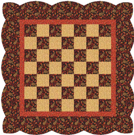
Finished Size 22 x 22